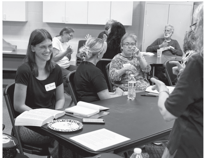
The Church Interpreter Training Academy holds an annual workshop at St. Paul, Flint

within the District struggle to serve their Deaf members without regular interpretation of Sunday morning Divine Service.