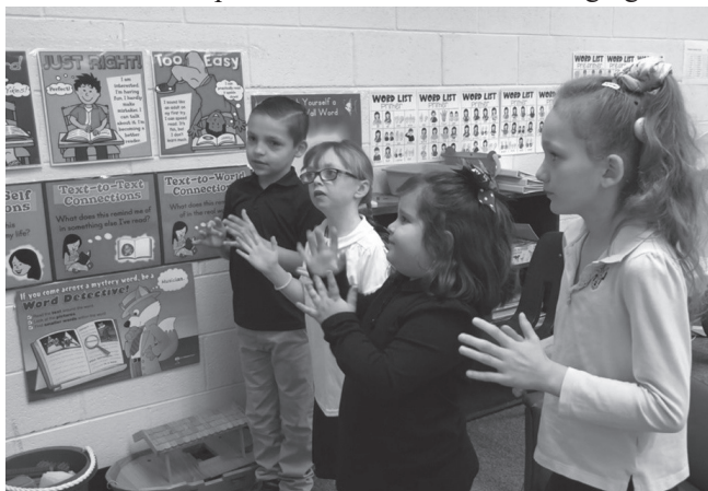
Deaf children during lesson at St. Martin Lutheran School for the Deaf