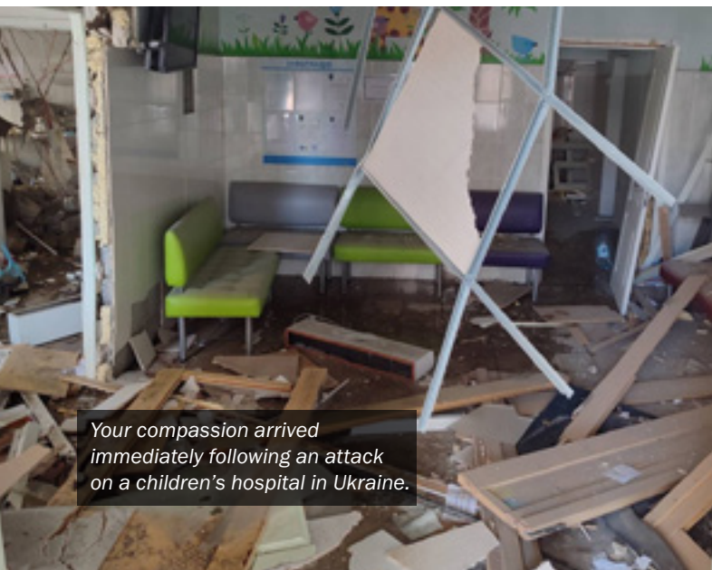
Your compassion arrived immediately following an attack on a children's hospital in Ukraine.