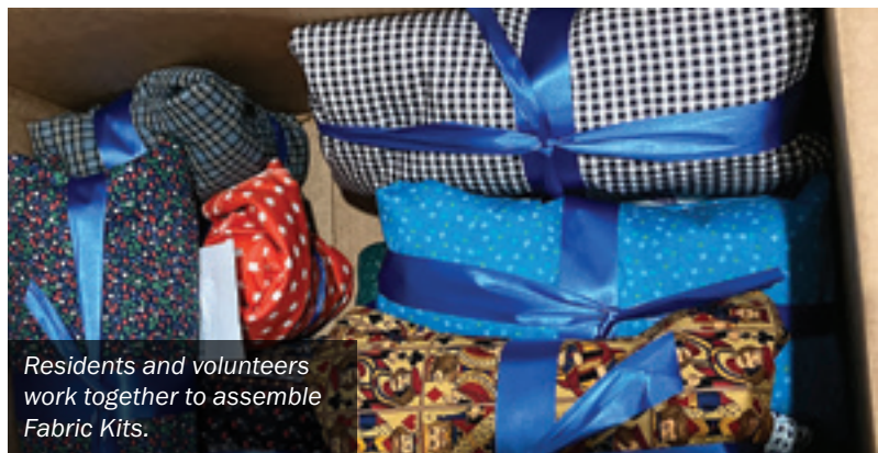
Residents and volunteers work together to assemble Fabric Kits.

"It's a great opportunity to show others we are never too old to serve," Barbara says. ■