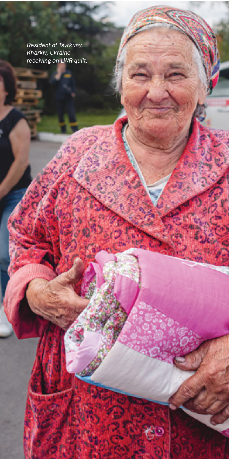
Resident of Tsyркuny, Kharkiv, Ukraine receiving an LWR quilt.

LEADER: God, you call us to love our neighbors as ourselves. Send forth your Spirit today as we call upon you to bless our work and make it holy. Help these quilts and kits, our offerings of hope, travel across the farthest distances to reach our most weary neighbors and surround them with your grace and peace.