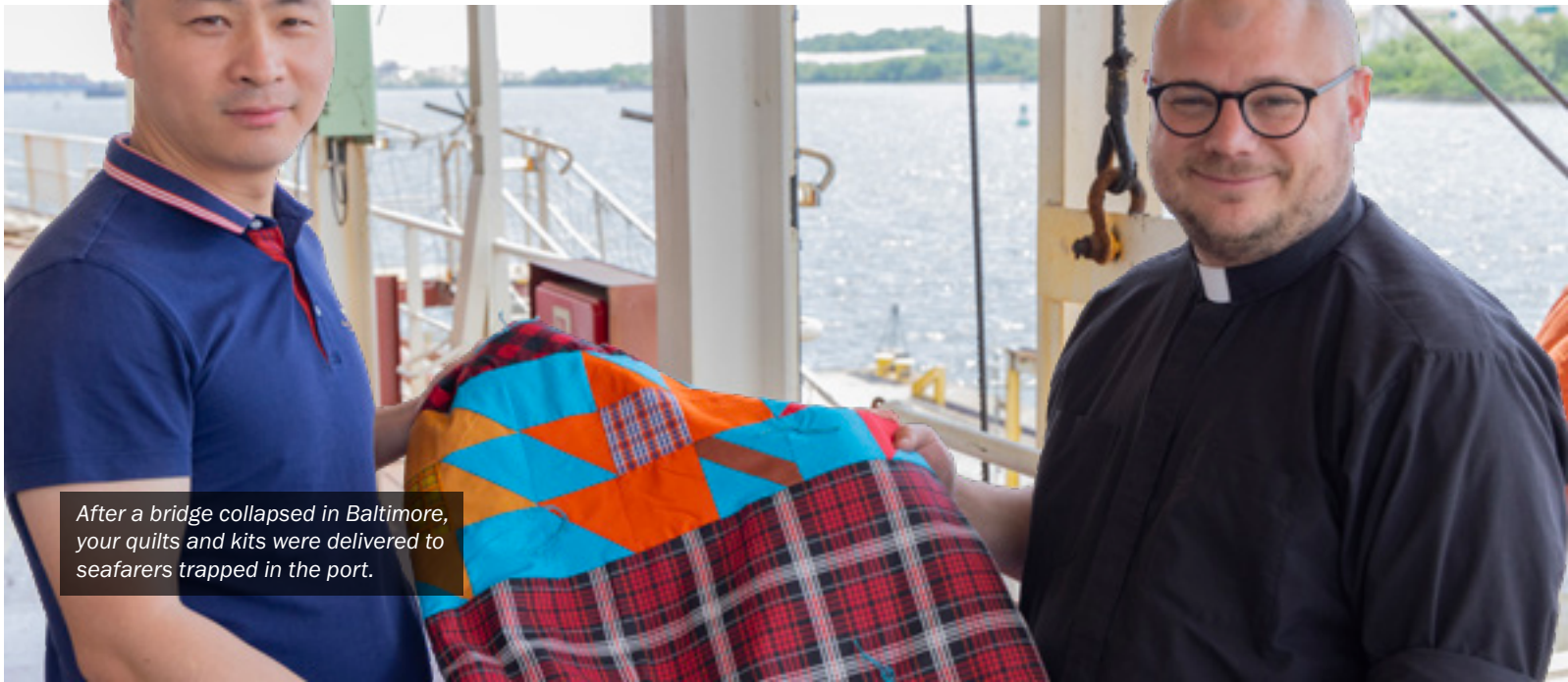
After a bridge collapsed in Baltimore, your quilts and kits were delivered to seafarers trapped in the port.